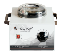
Wax Heater (Single)