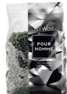
Pour Homme (For Men)

Innovative "Selfie" wax formulation was created specifically to remove unwanted hair on the sensitive face skin. Wax "Selfie" is formulated resin-free and is created to remove hair on the sensitive skin of the face. Natural oils complex in wax composition cushions wax effect on face, creates maximum protection and extra comfort during the procedure. Wax does not burn and does not injure delicate skin, it does not leave redness even on thin and sensitive skin. The working temperature of the wax is + 38 °C.