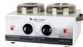
Wax Heater (Double)